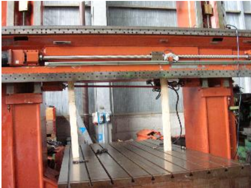
TABLE DIMENSIONS: 3500 X 2000 mm