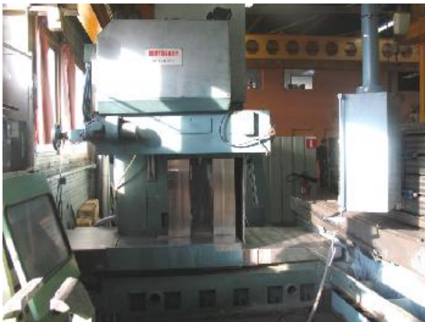
TABLE DIMENSIONS: 2000 x 815 mm LONGITUDINAL TRAVEL: 2000 mm TRANSVERSAL TRAVEL: 815 mm VERTICAL TRAVEL: 1090 mm SPINDLE NOSE TAPER: ISO 50 SPINDLE MOTOR POWER: 32 hp SPINDLE SPEED ROTATION: 20 - 2000 rpm CNC: DYNAPATH DELTA 20