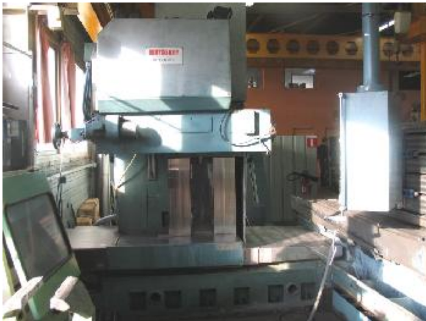
TABLE DIMENSIONS: 2000 x 815 mm LONGITUDINAL TRAVEL: 2000 mm TRANSVERSAL TRAVEL: 815 mm VERTICAL TRAVEL: 1090 mm SPINDLE NOSE TAPER: ISO 50 SPINDLE MOTOR POWER: 32 hp SPINDLE SPEED ROTATION: 20 - 2000 rpm CNC: DYNAPATH DELTA 20