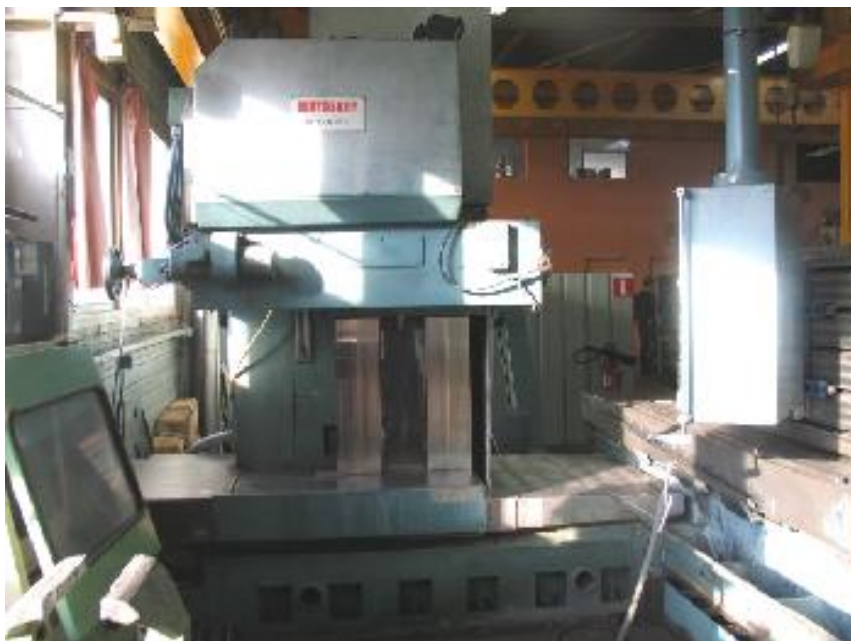
TABLE DIMENSIONS: 2000 x 815 mm LONGITUDINAL TRAVEL: 2000 mm TRANSVERSAL TRAVEL: 815 mm VERTICAL TRAVEL: 1090 mm SPINDLE NOSE TAPER: ISO 50 SPINDLE MOTOR POWER: 32 hp SPINDLE SPEED ROTATION: 20 - 2000 rpm CNC: DYNAPATH DELTA 20